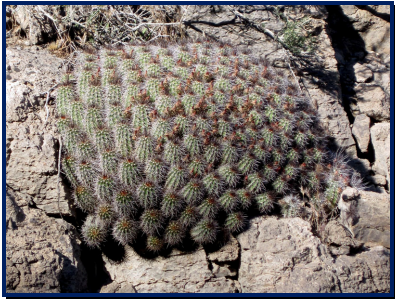
Echinocereus mojavensis – Grand Canyon West