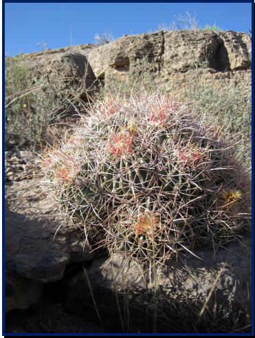
Echinocactus polycephalus – Grand Canyon West