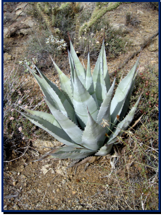
Agave desertii – Yucca, AZ