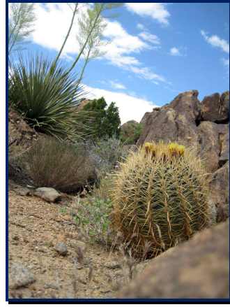
Ferocactus cylindraceus – Yucca, AZ