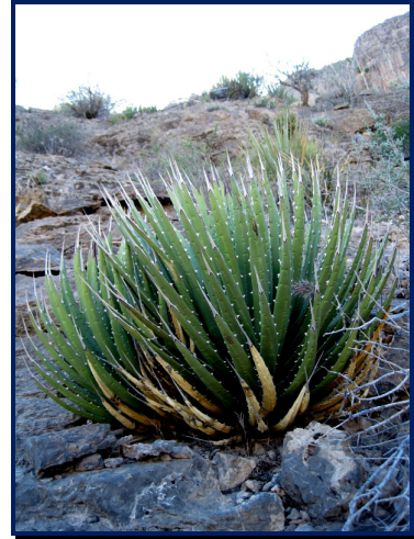
Agave utahensis – Grand Canyon West