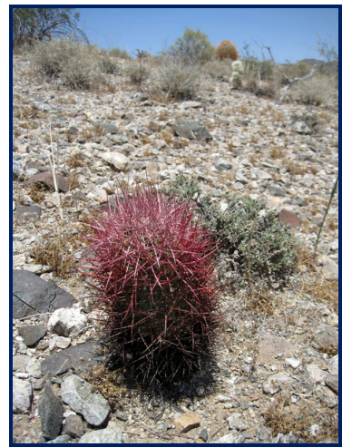
Echinomastus johnsonii – Meadview, AZ