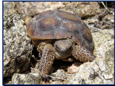
Desert tortoise – Yucca, AZ