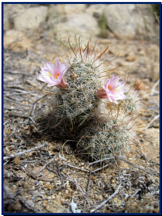
Mammillaria grahamii – Yucca, AZ