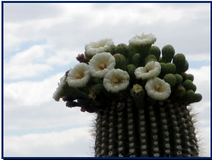
Carnegiea gigantea – Yucca, AZ