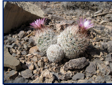
Escobaria vivipara – Grand Canyon West