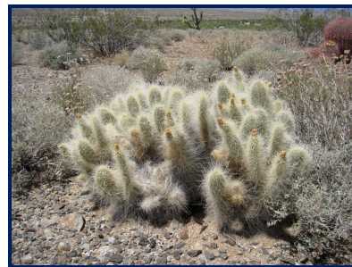
Opuntia ursina – Meadview, AZ