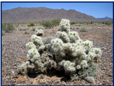
Cylindropuntia multigeniculata – Meadview, AZ