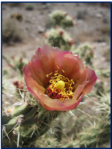
Cylindropuntia acanthacarpa – Meadview, AZ