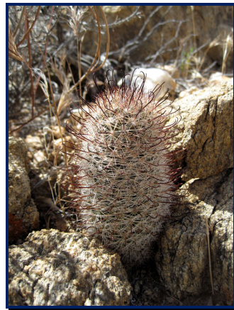
Mammillaria tetrancistra – Yucca, AZ